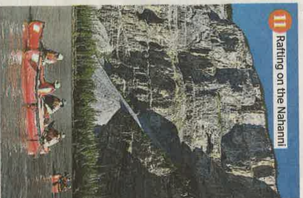
11 Rafting on the Nahanni

Details: Eight nights, including two in Vancouver, two in Whistler, four nights' glamping, car hire and flights, costs from £4,857/pp (020 8776 8709, frontier-canada.co.uk)