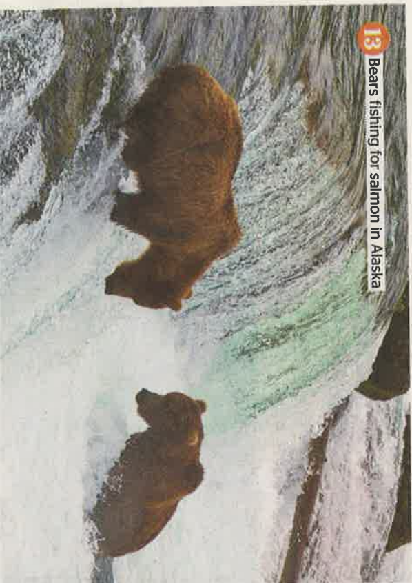
13 Bears fishing for salmon in Alaska