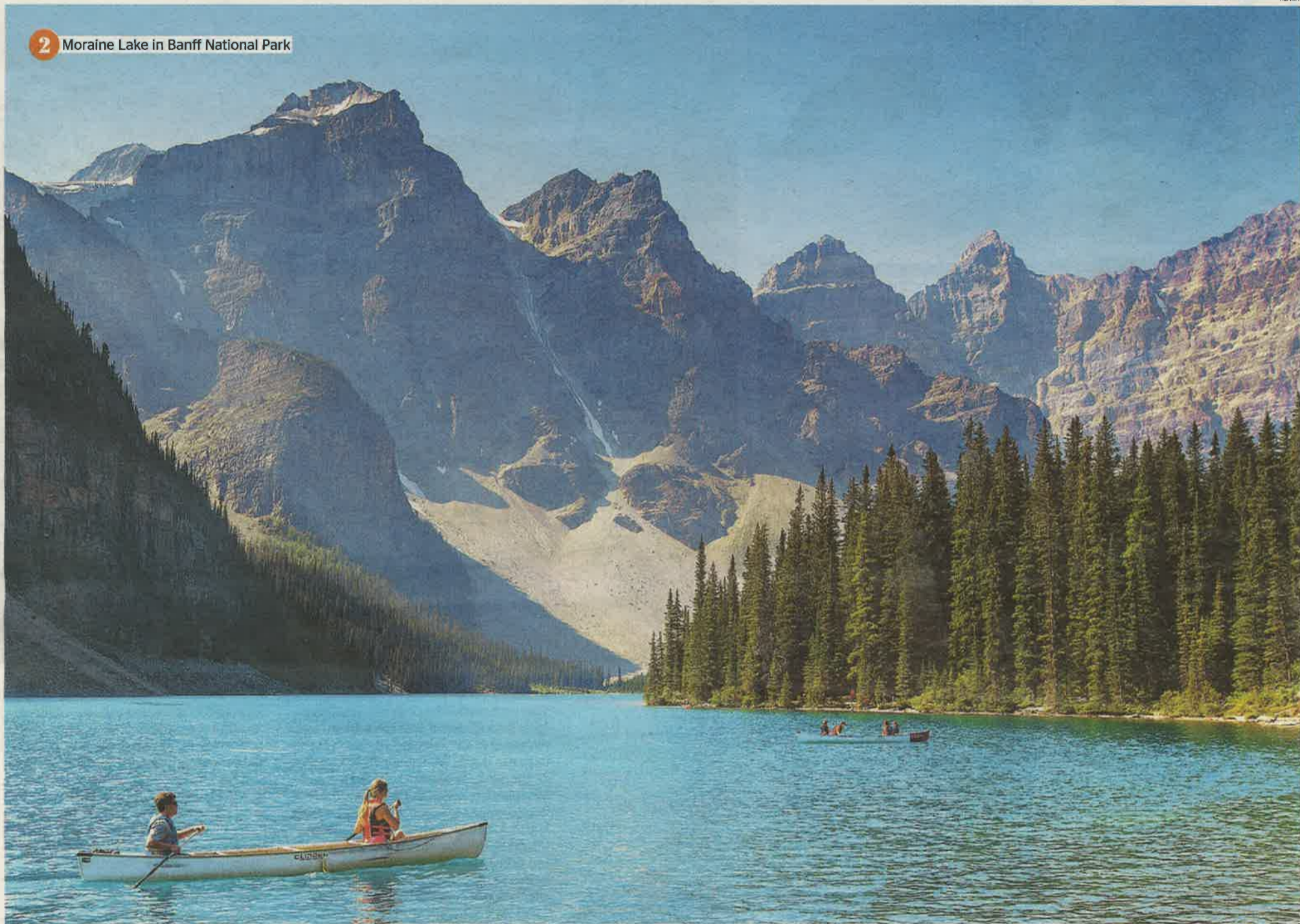
2 Moraine Lake in Banff National Park

Ben Clatworthy goes ski racing in the French Alps